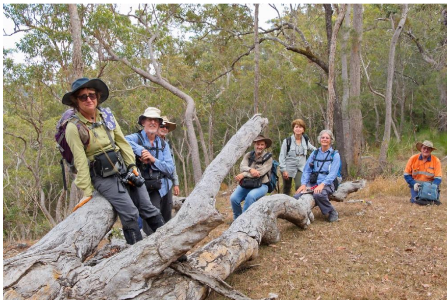
Walkers resting on the way to Lost Rock